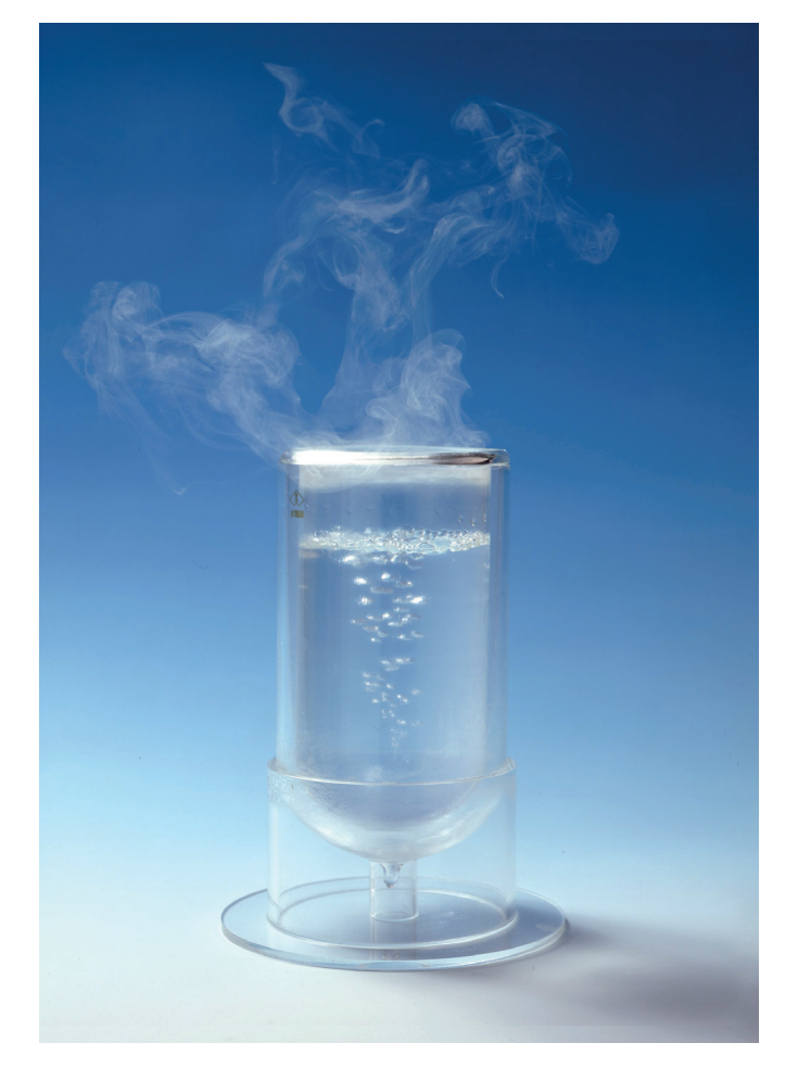
Figure 1. LNG "boiling" at atmospheric pressure and temperature

The liquefaction process cools natural gas to a temperature below its boiling point, changing it to a liquid with a volume approximately 600 times lower than that occupied by the gas. Before distribution to industrial and residential consumers LNG is converted back into natural gas (regasified) by warming it back above its boiling point.