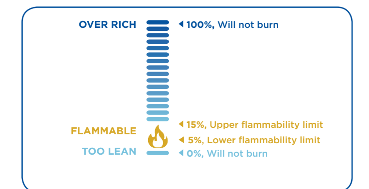
Figure 4. Flammability range for methane