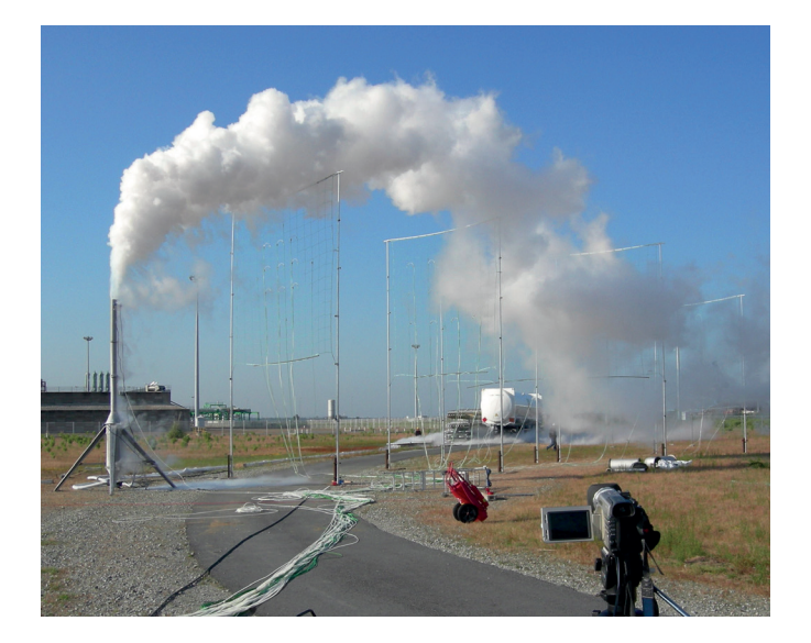
Figure 2. LNG Vapour Cloud created at ENGIE Lab CRIGEN LNG testing facility

For a relative humidity of higher than 55%, the flammable cloud is totally included in the visible vapour cloud. If the relative humidity is less than 55%, the flammable cloud can be partially or completely outside of the visible cloud, which means that the vapours could be ignited even though the ignition source is distant from the visible vapour cloud. The size of the vapour cloud will depend on wind speed, direction, and other weather conditions and can easily be predicted by the appropriate related calculations. These very cold vapours will rise as they are sufficiently warmed by ambient air.